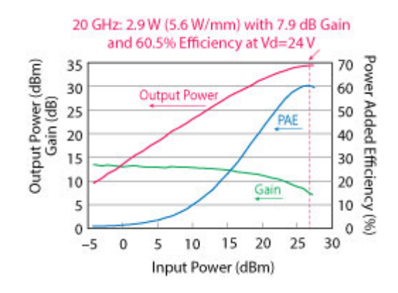
Figure 3 Example device shows 61 percent PAE from a 2.9 W (5.6 W/mm) HEMT with 7.9 dB gain. Bias point is 24 V.

F. Ejeckam, D. Francis, F. Faili, D.J. Twitchen, B. Bolliger, J. Felbinger and D. Babic, "S2-T1: GaN on Diamond: A Brief History," Lester Eastman Conference on High Performance Devices , August 5–7 2014, DOI: 10.1109/LEC.2014.6951556. INSPEC Accession Number: 14775316.